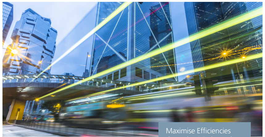
Maximise Efficiencies through Digital Supply Chain Managed Services

NHS eProcurement – In the UK the Pan-European Public Procurement On-Line (PEPPOL) standard has been mandated to automate the NHS supply chain for digital ordering, invoicing and shipping for all NHS suppliers and providers. Transalis is a Crown Commercial Services PEPPOL provider where NHS