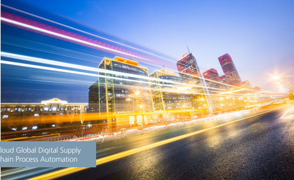
Cloud Global Digital Supply Chain Process Automation